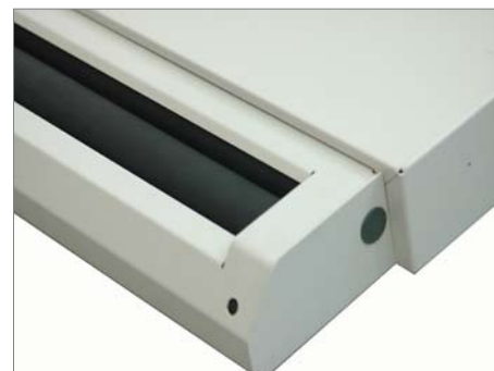
Built-in edge folding unit.