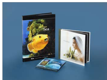
Create professional, customized hard covers and cases according to your needs.