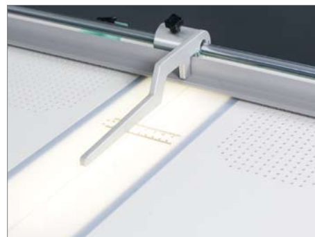
Scaled light table, positioning line, suction assistance and interchangeable spine guides