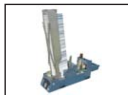
LC IN FEEDER