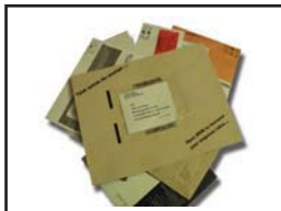
COURIER ENVELOPE MAILER